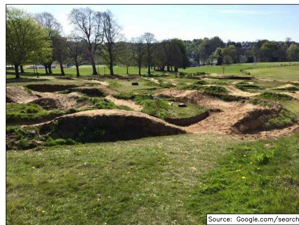
SOUTHAMPTON BIKE PARK, SOUTHAMPTON, UK