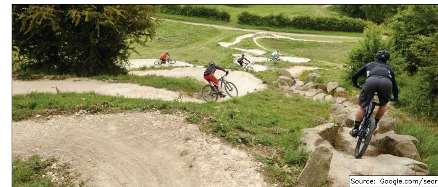
HADLEIGH PARK CYCLES, BENFLEET, UK