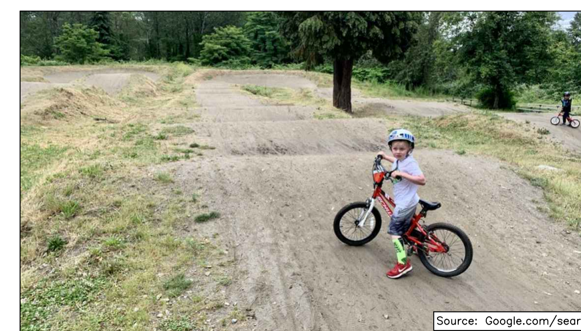
SEATAC BIKE PARK, SEATTLE, USA