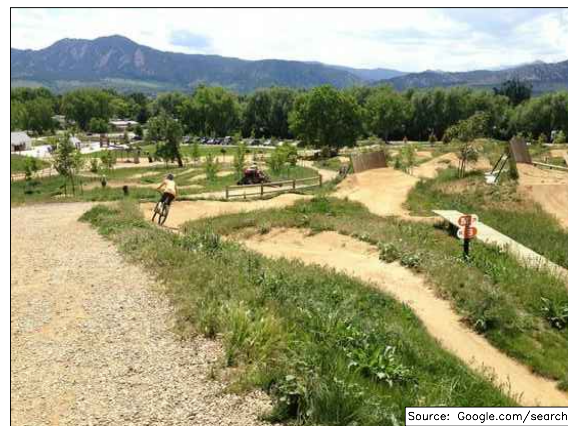
VALMONT BIKE PARK, BOULDER, USA